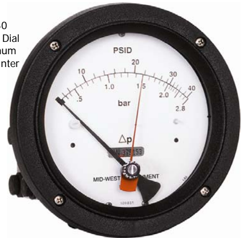
Model 140 with 4-1/2” Dial and maximum follower pointer

“A World Leader in Differential Pressure Gauges, Switches & Transmitters”