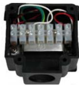
Model 142 shown with “BA” switch option

(2) Reed switches located inside NEMA 4x enclosure with 7 position terminal strip. An opening at rear of enclosure accepts ½” flexible weather-proof or conduit connector (supplied by customer).