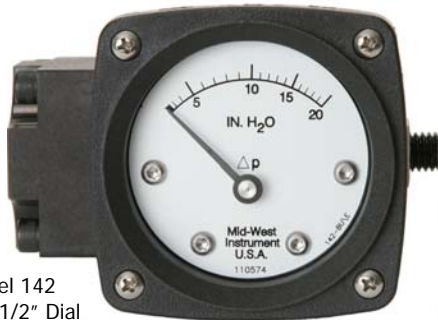
Model 142 with 2-1/2” Dial

“A World Leader in Differential Pressure Gauges, Switches & Transmitters”