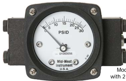
Model 140 with 2-1/2” Dial